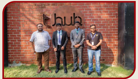
IFS OTs calling on Indian dignitaries (Governors, Chief Ministers and senior officials) and visits to the projects/facilities of Indian States as part of their State Attachment