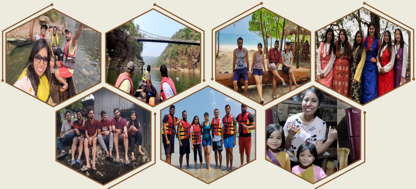
IFS OTs' visit to Andamans, Sikkim, Kolkata, Puducherry & Hyderabad as part of their Bharat Darshan tour