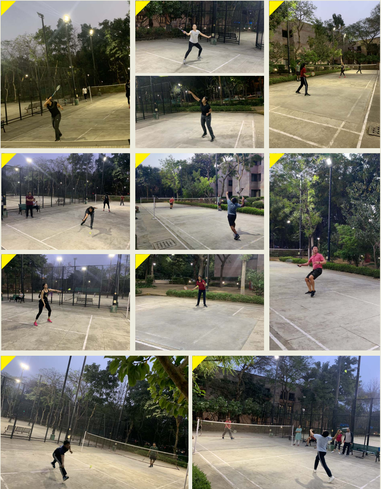
IFS OTs' sports activities at SSIFS Campus