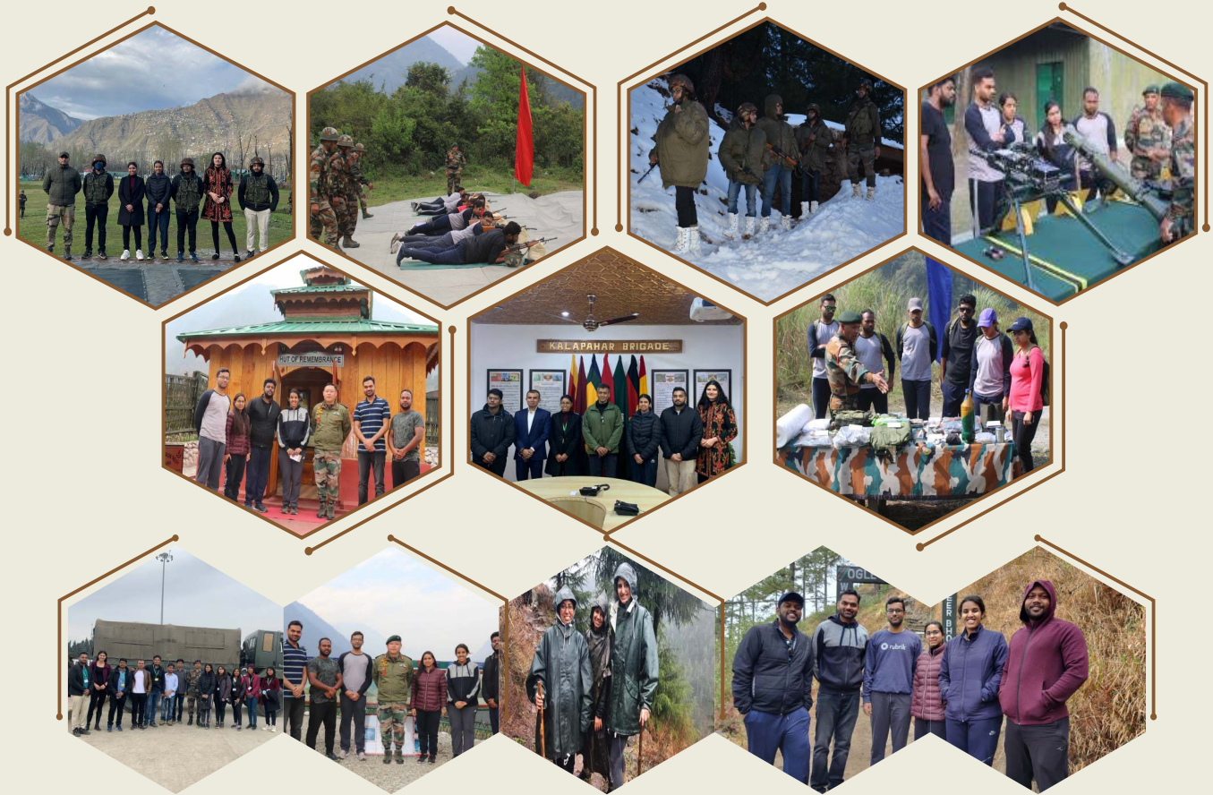
IFS OTs' visit to Bagdogra, Dibrugarh and Srinagar as part of their Army attachment