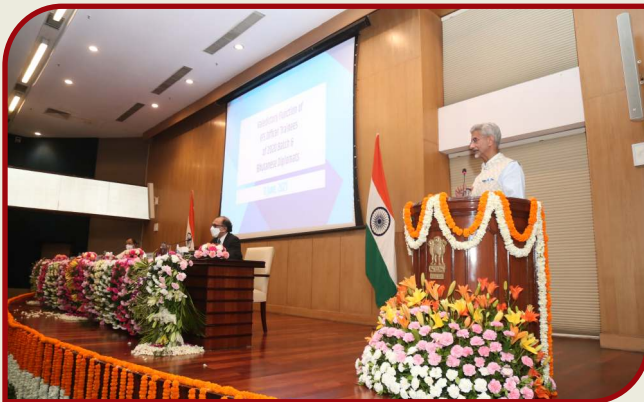
EAM addressing the IFS OTs

A valedictory ceremony was organized on 08 June 2021, which was presided over by Dr. S. Jaishankar, Hon'ble External Affairs Minister (EAM) as Chief Guest. Shri V. Muraleedharan, Hon'ble Minister of State for External Affairs (MoS) participated as Guest of Honour. Awards were given on the occasion to deserving OTs of the 2020 batch.