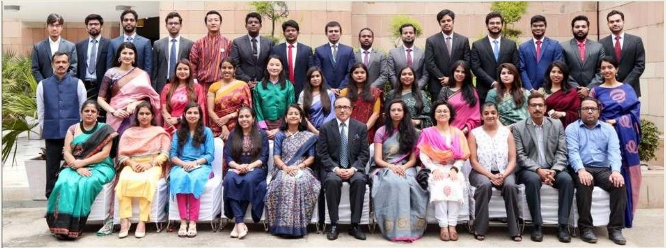
SSIFS Faculty, IFS OTs 2020 Batch & Bhutanese Diplomats